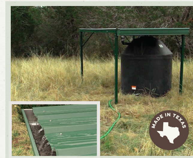
Water Table 305