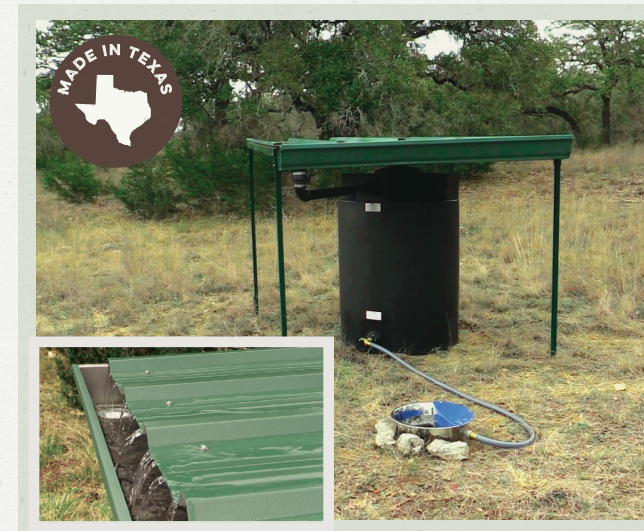
Water Table 100

Attract wildlife to your land with the wildlife rainwater collection system that sets the standard that sets the standard for wildlife products.