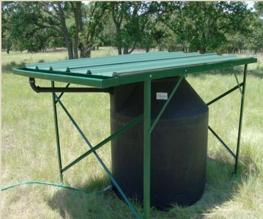
Water Table 305